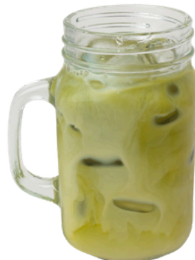
Thai Green Milk Tea