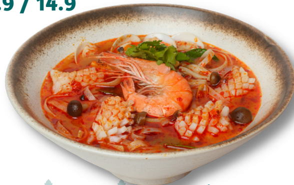
Red Tom Yum Noodle Soup

Prices are subject to 10% service charge and 9% GST