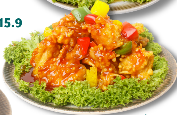
Sweet & Sour Fried Chicken