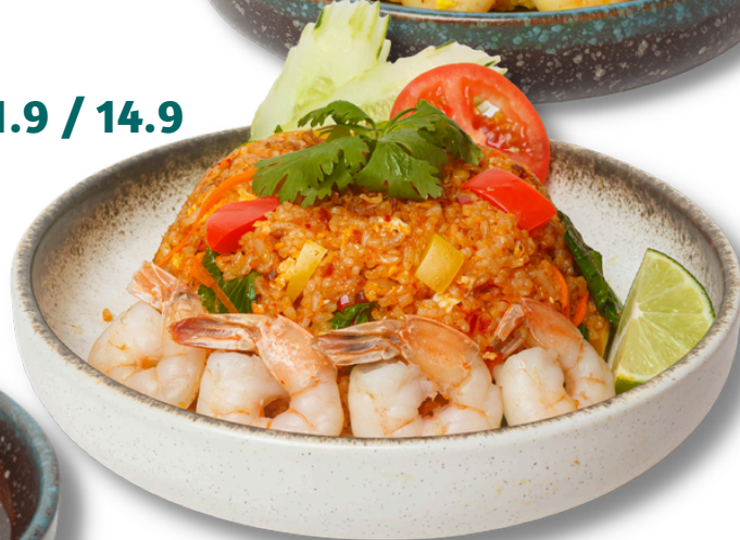
Tom Yum Fried Rice