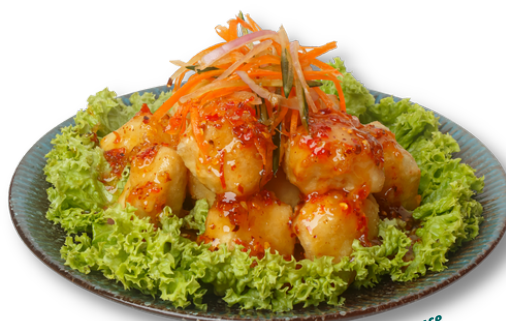
Deep-Fried Tofu w Sweet Thai Chilli Sauce