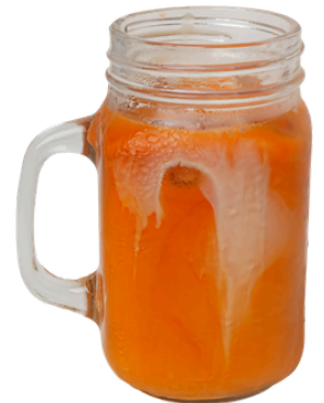
Thai Milk Tea