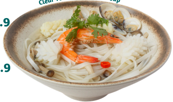
Clear Tom Yum Noodle Soup