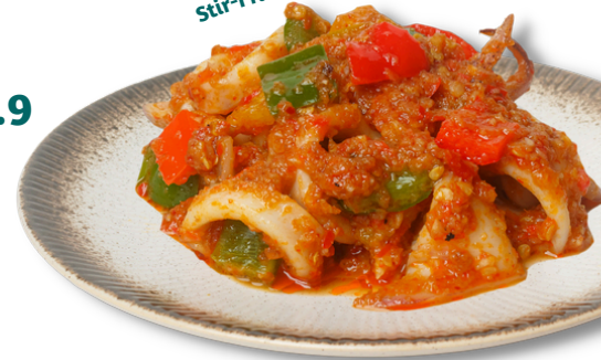
Stir-Fried Squid w Sambal