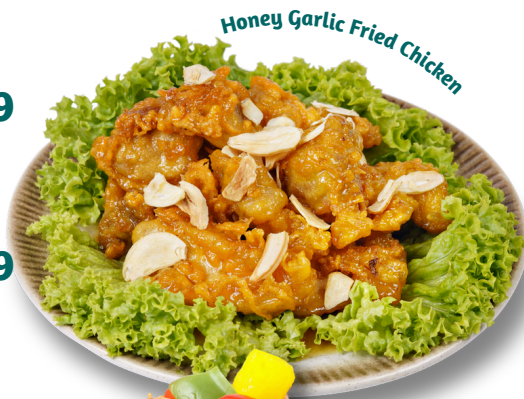
Honey Garlic Fried Chicken

Stir-fried minced chicken with Thai basil, long bean, onion and chilli.