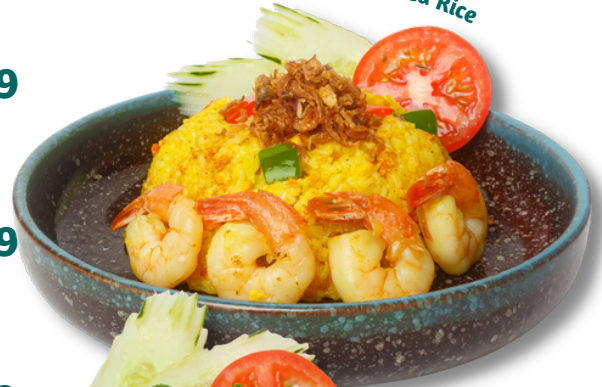
Pineapple Fried Rice