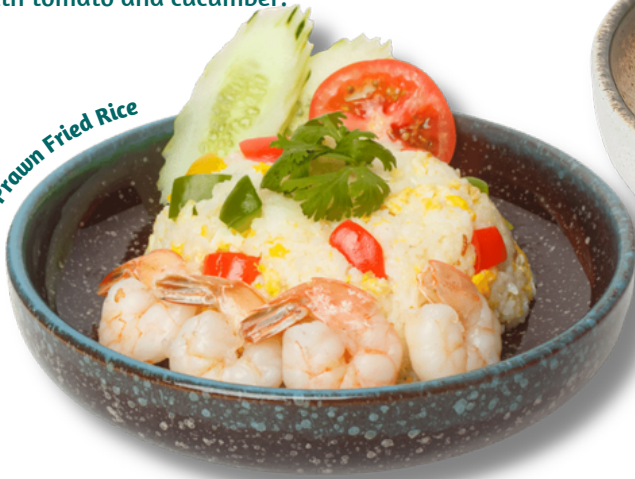
Prawn Fried Rice