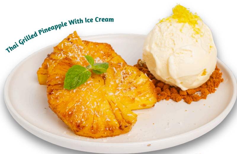
Thai Grilled Pineapple With Ice Cream